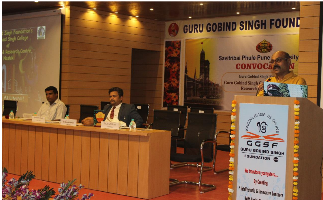
Inaugral Ceremony of 2 nd Alumni Meet