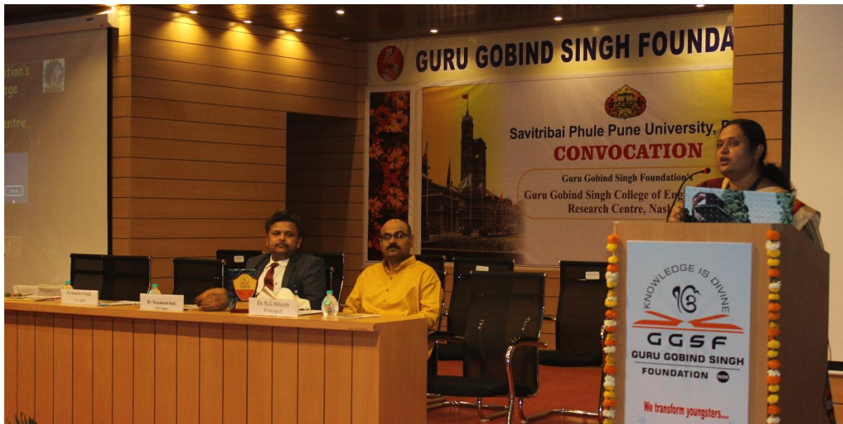
Welcome Note of 2 nd Alumni Meet